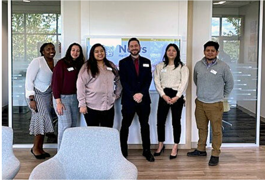
LANNWS-08-09-23 IL BANKS 2