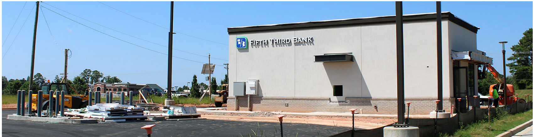
LANNWS-08-09-23 IL BANKS 3